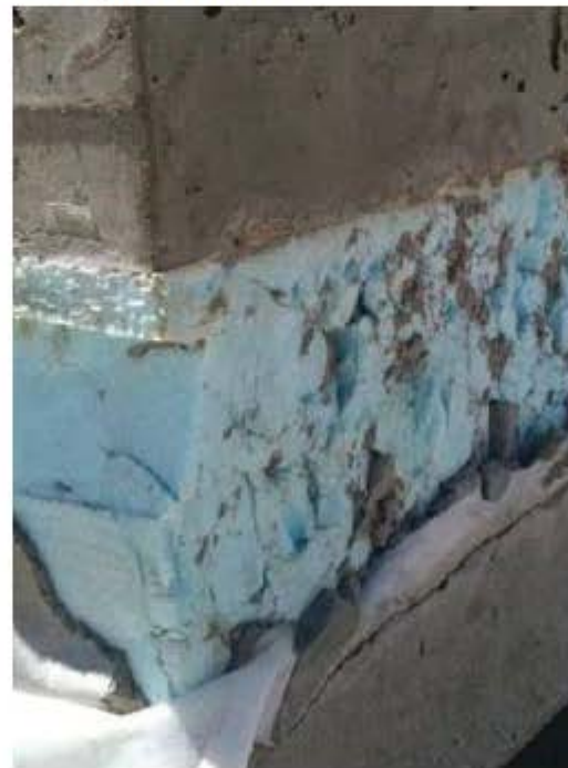
When left unprotected, insulation and cavity are vulnerable to moisture penetration.