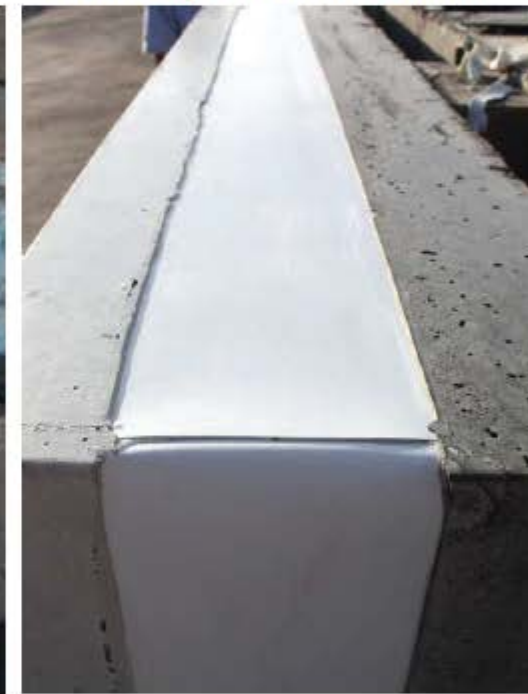
Victory Bear's Insulated Panel Cap provides valuable protection with minimal effort.